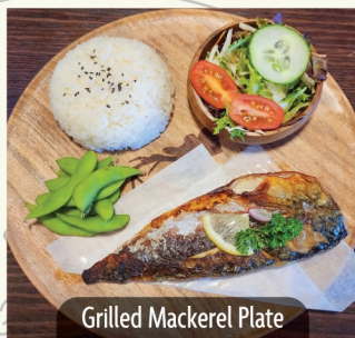
Grilled Mackerel Plate